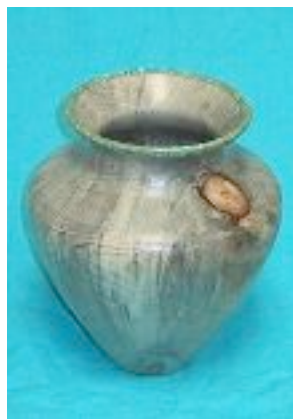
Larry Fox's first vessel after studying with Trent Bosch.