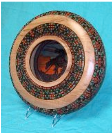
Jim Carey weaves a good story